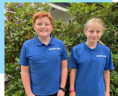
Kakapo Leo and Emily